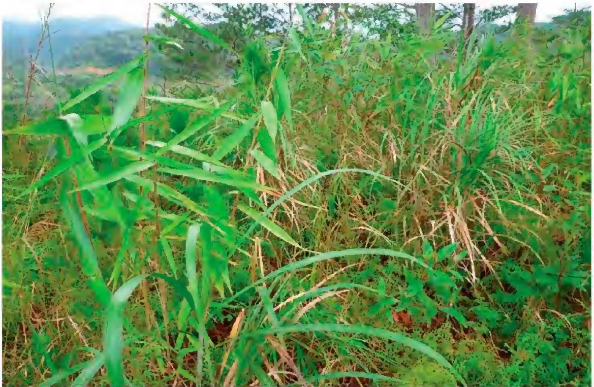
Figure 2: Character of herb layer near Nepenthes smilesii population.